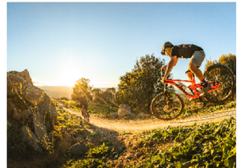
Stromlo Mountain Biking - potential elective