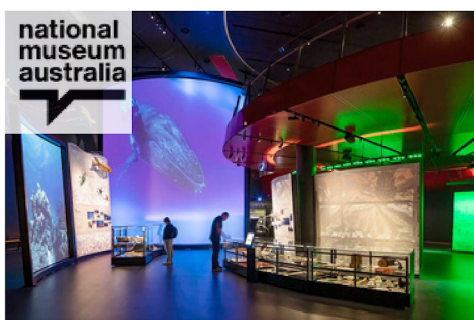
National Museum of Australia - Canberra Day

At this camp there were around 300 campers in attendance.