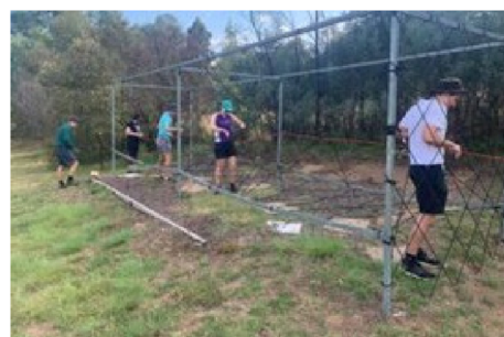
Team Initiatives - onsite activity