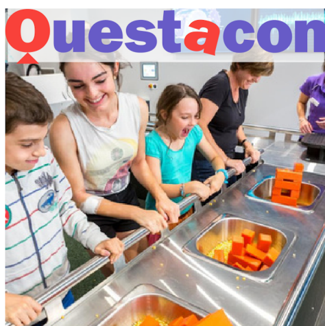
Questacon - Canberra Day

PAC21 is the 21st Pan Australia Camp and will be the third PAC held in Canberra. Here's some key information about the previous Canberra based camps.