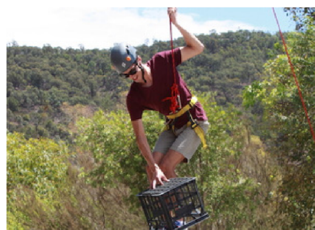
Crate Climb - onsite activity

You may have seen on the Facebook group for PAC21 in which a sample program looking forward 12 months was posted. Prospective campers that have been through the pre-registration process have been allocated camper numbers and sent initial registration information. As we write this update, there are 70 registered against the camp goal of 200 so make sure you get your registration in! Some of the likely activities for this camp are featured on each page.