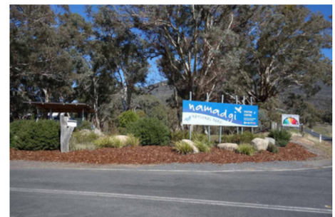
Mt Tennant Hike - potential elective